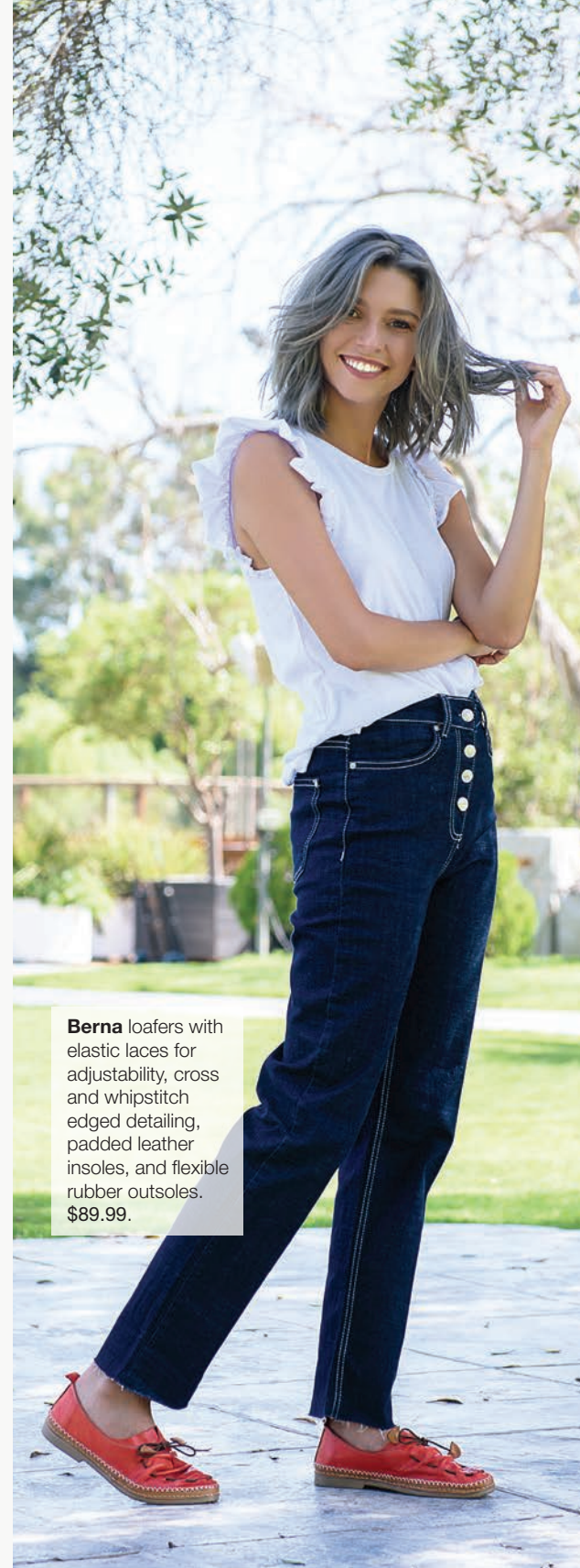
Berna loafers with elastic laces for adjustability, cross and whipstitch edged detailing, padded leather insoles, and flexible rubber outsoles. $89.99.