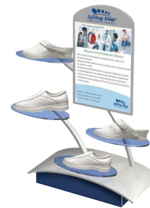
A-408 | 9150009 4 Shoe Table Top Display