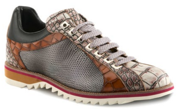
LGRYM-LIGHT GREY MULTI