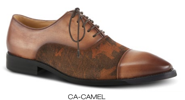
O/ ( O/ (i)

967509 | 169.95 | 40-47 Open Stock | Leather Combo