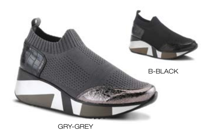
ENKA 🔤 🄀 🏏 927509 | 79.95 | 36-41 Open Stock