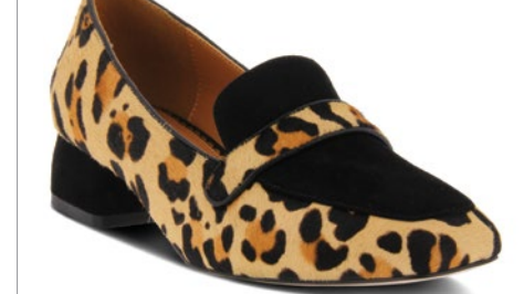
BMS-BLACK LEOPARD MULTI