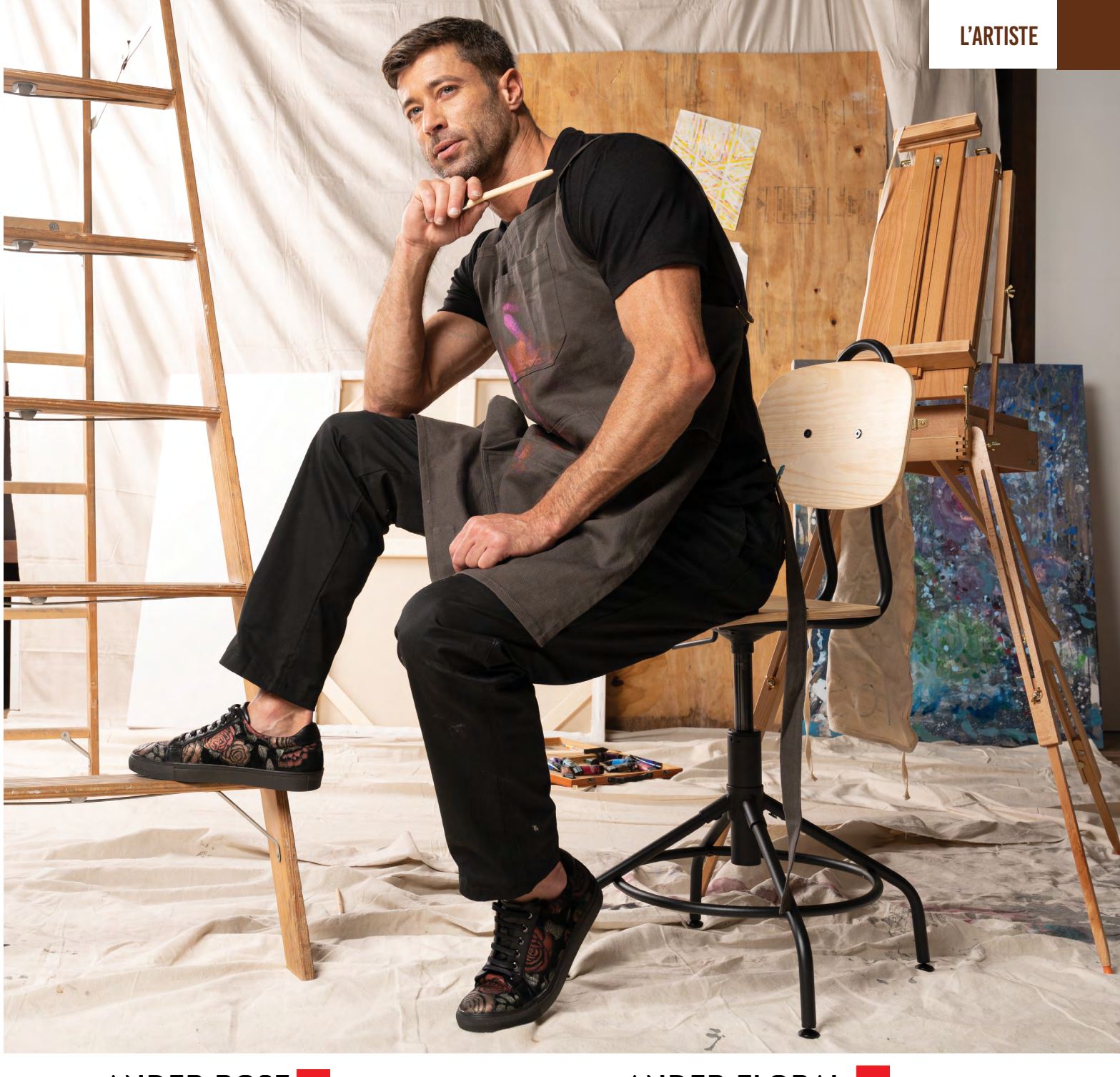
ANDER-ROSE NEW 955009 | 149.95 | 40-47 Open Stock | Leather