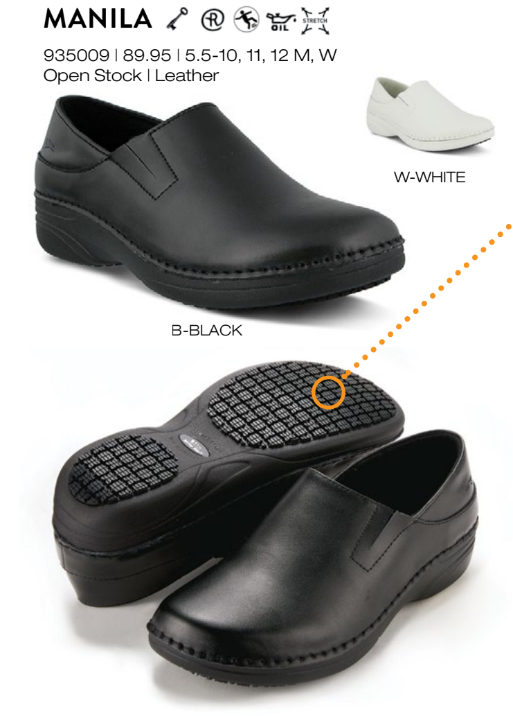
MANILA-GLATIC ® 💥 😚 🐨

Spring Step Professional was designed for the woman or man to look and feel their best on the clock or even after hours.