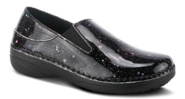
BMP-BLACK MULTI PATENT

939509 | 99.95 | 5.5-10, 11 M Open Stock | Patent Leather