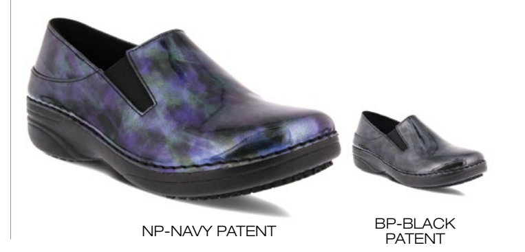
FERRARA & ® % # }

932509 | 79.95 | 5.5-10, 11 M, W Open Stock