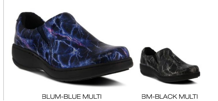
WINFREY-SRNE 🔤 ® 🗞 🚟 🏏

929509 | 69.95 | 5.5-10, 11 M Open Stock | Microfiber-Leather