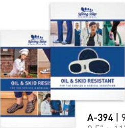
A-394 | 96009 8.5" x 11" Double Sided Counter Card