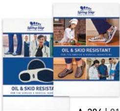
A-384 | 911009 2 Counter Card Set 5" x 7" & 8.5" x 11" Double Sided