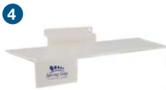
A-364 | 925009 10" x 3.9" 5 Pc Set Shoe Shelf