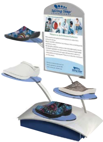
A-408 | 9150009 4 Shoe Table Top Display