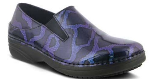
BLUP-BLUE PYTHON PATENT

932509 | 79.95 | 5.5-10, 11 M Open Stock