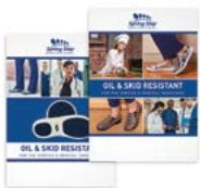
A-369 | 95009 5" x 7" Double Sided Counter Card

POP Material consists of slat wall shelves and signs, logo blocks, counter cards and other items currently available in our inventory. Please place your order according to your store and assortment needs which will be used against available co-op advertising dollars.