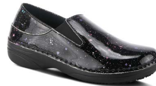
BMP-BLACK MULTI PATENT

942509 | 99.95 | 5.5-10, 11 M Open Stock | Patent Leather