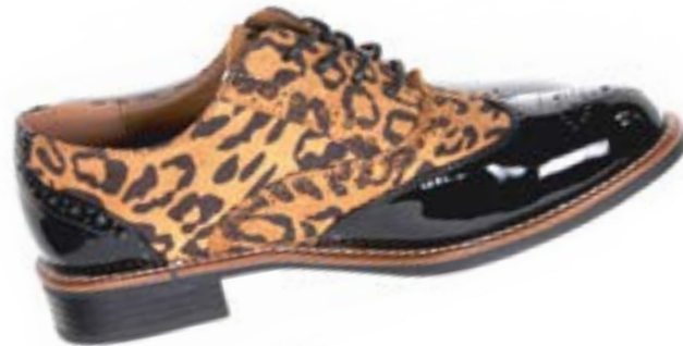
DELANCY | $69.95