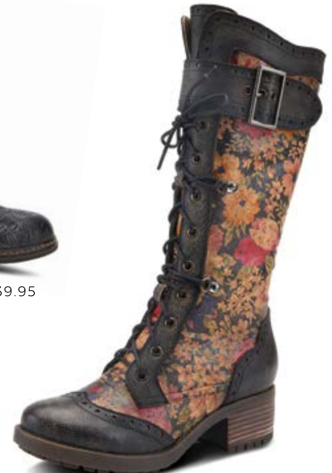
KISHA-FLORA | $189.95