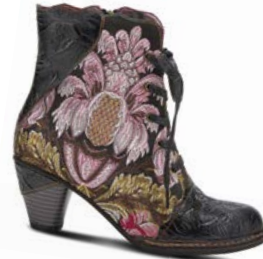
SIREN | $139.95