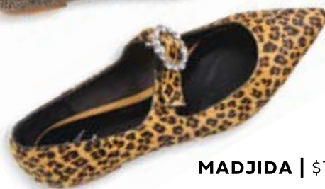
MADJIDA | $159.95