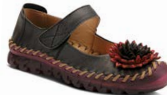
HIBISCAE | $129.95