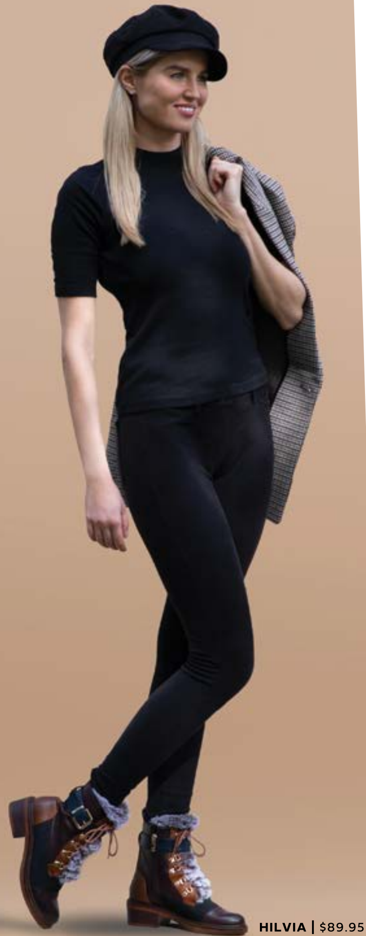
HILVIA | $89.95