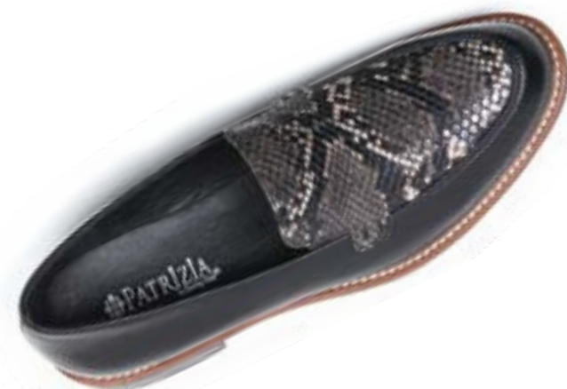
MADO | $69.95