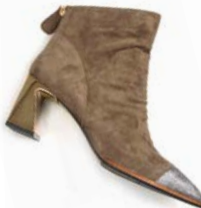
BELLAXIS | $199.95