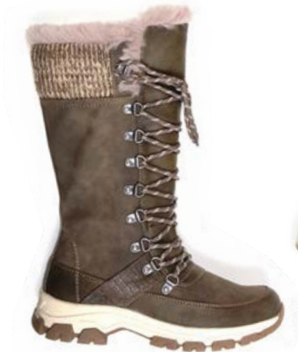
WOOLIBEAR | $99.95