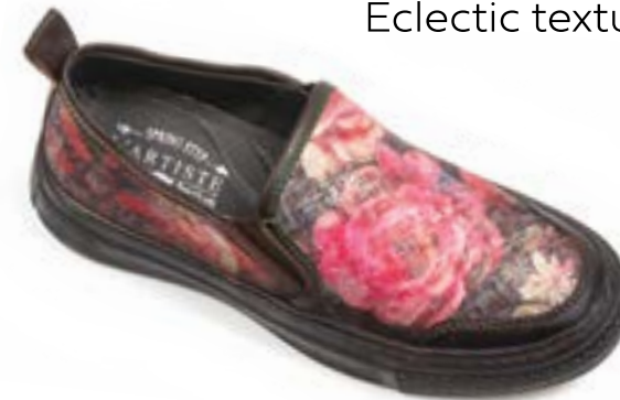
ROSEA | $99.95

French designed. Wearable works of art. Hand-painted luxurious leather. Eclectic textures. Ornate details.