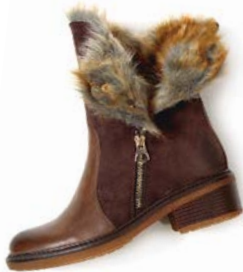
SAIGE | $89.95