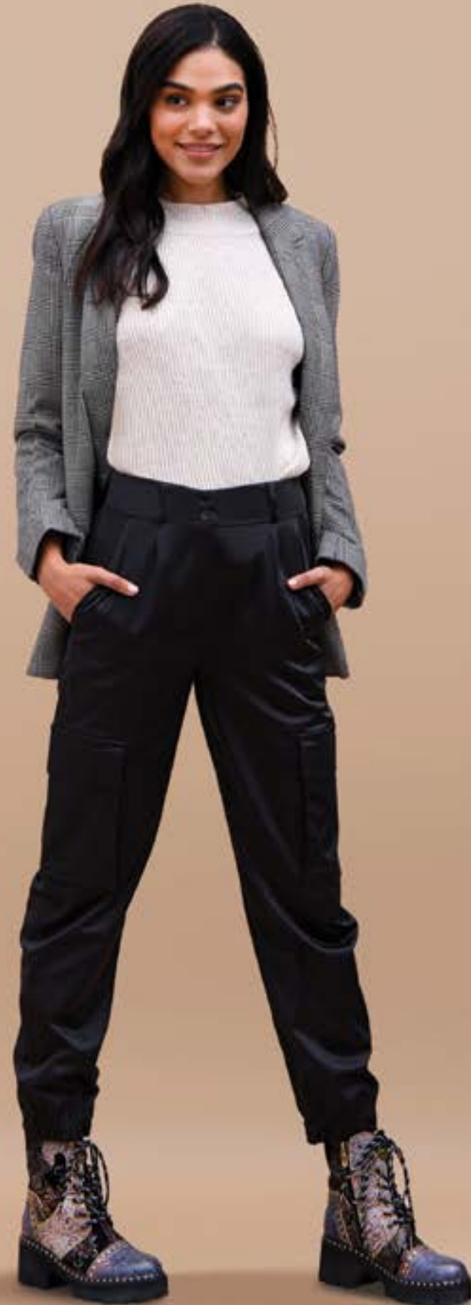
SEVERE | $169.95