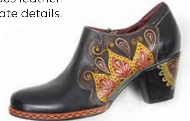
ZAMI | $119.95