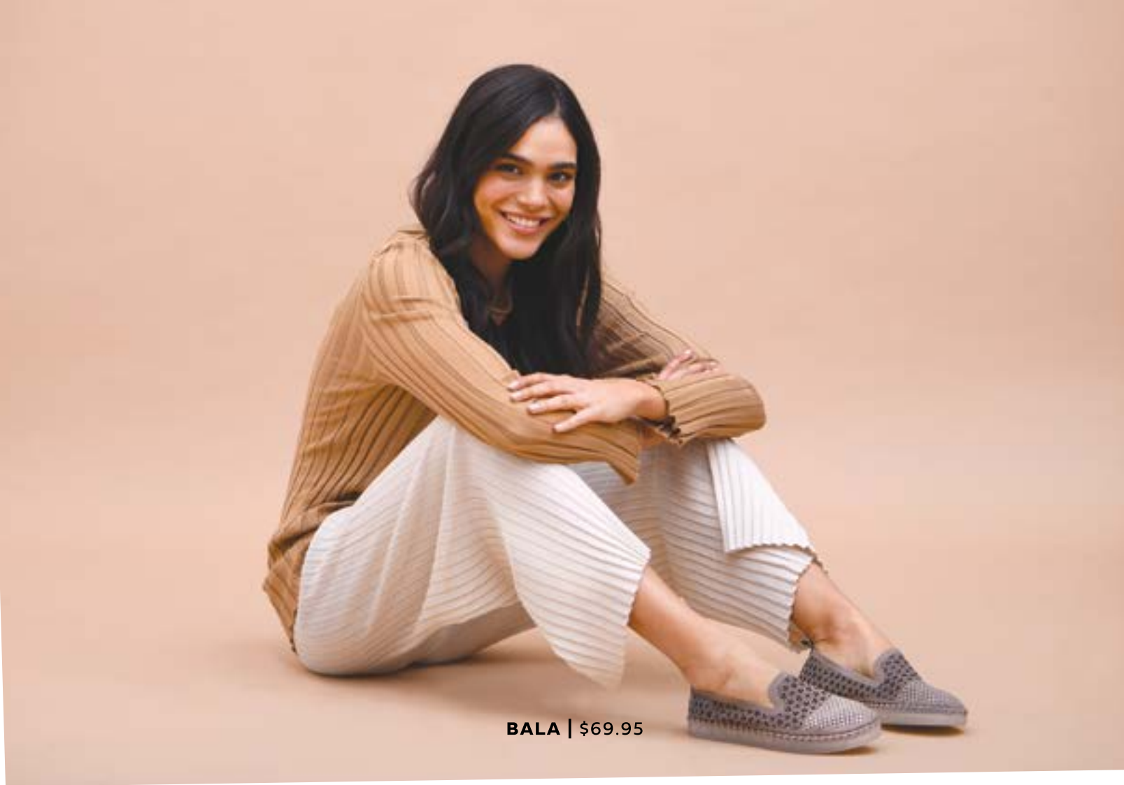
BALA | $69.95